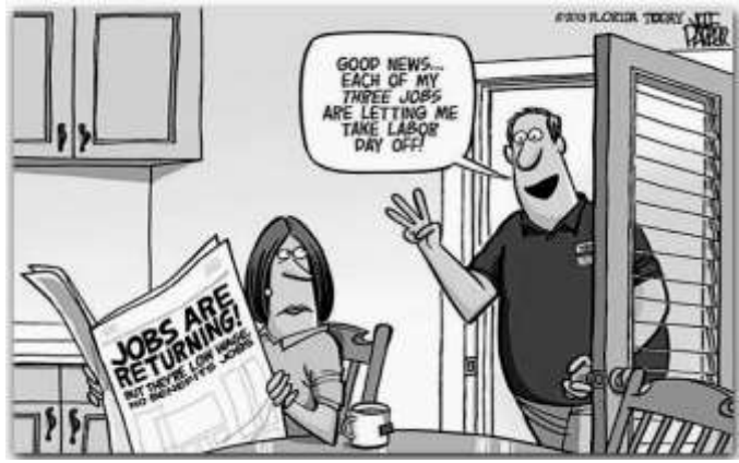
Disponível em: https://tinyurl.com/y3lrke6a Acesso em: 20 abr 2020.Original colorido.

A ironia da charge se constrói no fato de