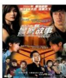
an action movie