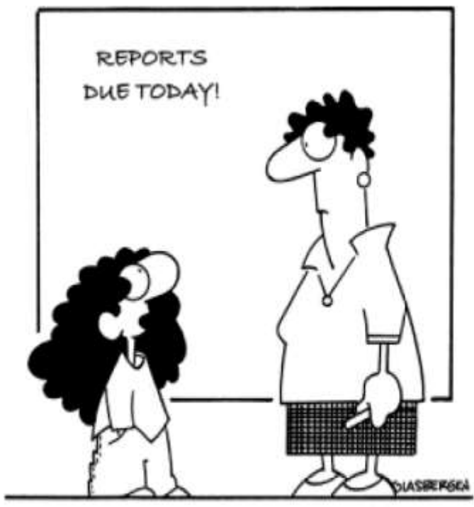
"My report is about how important it is to save paper, electricity, and other resources. I'll send it to you telepathically."