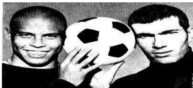
Including two of the world's best-paid football

What's more surprising: the fact that we now live in a world where almost a quarter of the population live in absolute poverty? Or the fact that for the first time ever, we possess the wealth, technology and knowledge to create a poverty free world in less than a generation?