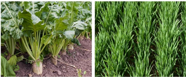
Crop rotation means that a field may be planted with sugar beets (L) one year and wheat (R) the next. This is a key factor in maintaining long-term soil health.