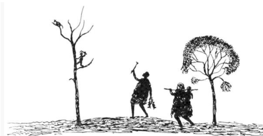
Illustration by an unknown artist from the introduction of More Australian Legendary Tales (1898), David Nutt.

Australian folk tales are largely indigenous with fantastical and terrifying creatures. Many of the folk tales HOWEVER , are non-indigenous and reflect the expansion of European settlements across Australia with stories of gold miners and drovers, OTHERWISE known as cattle herders. The folk tales paint a picture of a resilient and independent people, who rise to any challenge and are not afraid to confront and oppose authority.