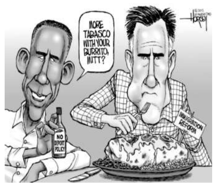
Disponível em: http://gg.gg/vulji Acesso em: 05 ago. 2021.