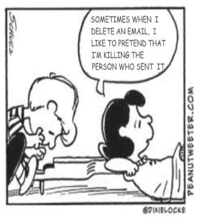
Disponível em: http://gg.gg/vulkb Acesso em: 05 ago. 2021.

Peanuts é uma tirinha americana escrita e ilustrada por Charles M. Schulz. Foi uma das tirinhas mais populares e influentes com 17,897 publicações - o maior número na história.