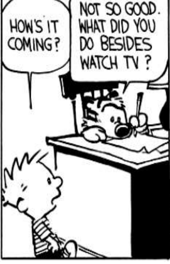
Watterson. Bill Disponível Calvin Hobbes by https://www.gocomics.com/calvinandhobbes/1986/09/16. Acesso em 20 de